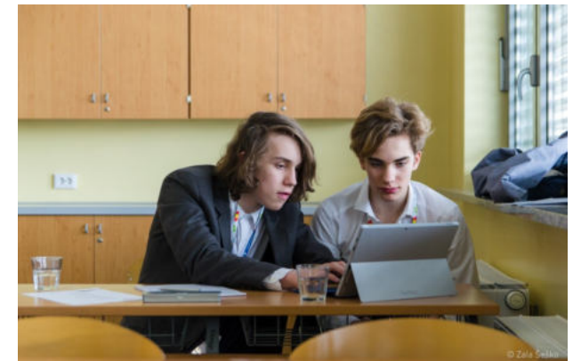
EUSALP people discussing stuff