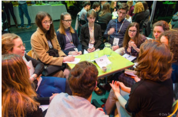
Discussion in the World Café