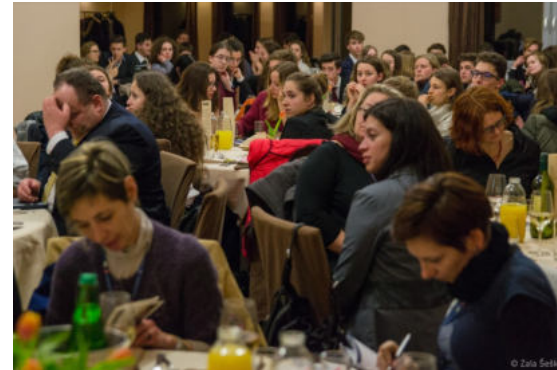
Dinner at the Hotel Draš