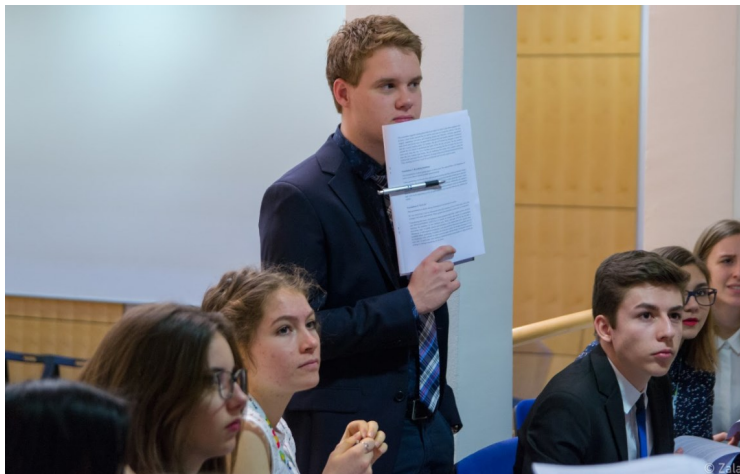
When they actually ask the question you have been fearing