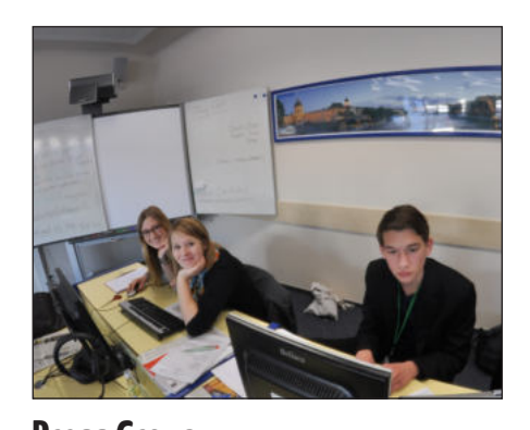
Press Group Working - of course!