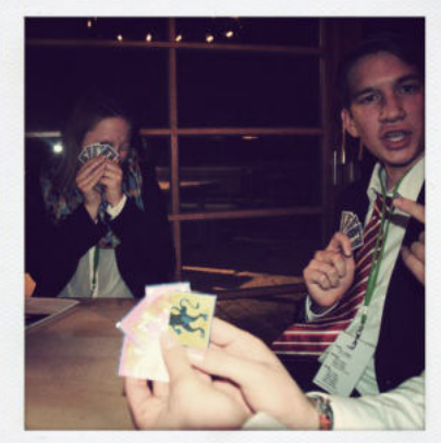
Can you read my PokerFace?