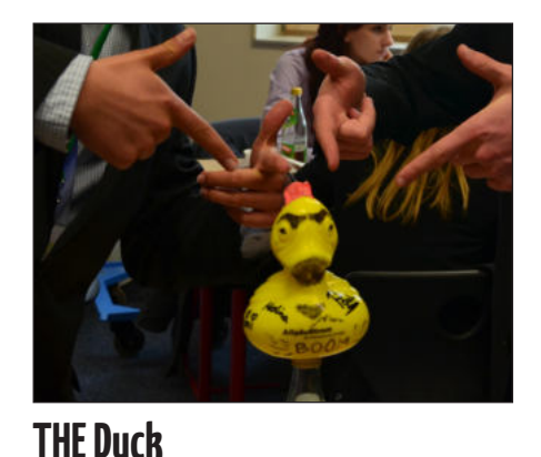
Consisting out of 9 gramm yellow plastic and a little red hat makes it the most productive and popular member of the YPAC!