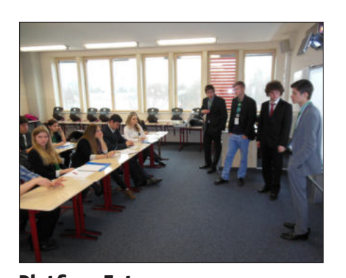
Platform Future Time travels to make a better future...