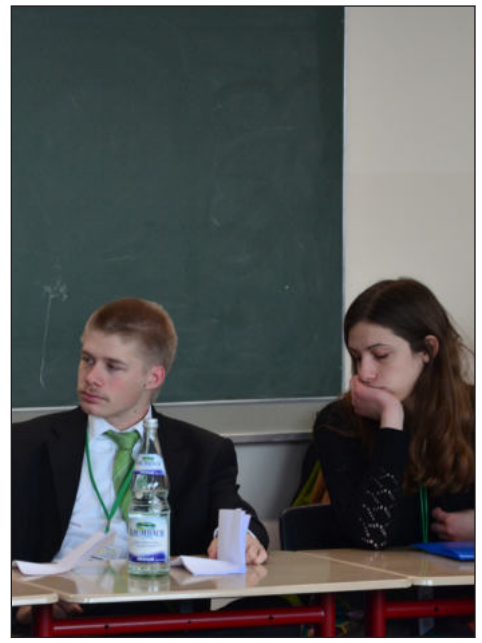
"Today was absolutely a productive day. What a day of hard work! Delegates are doing great things!"