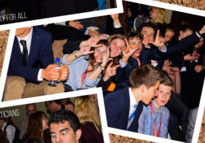
TRYING TO LOOK LIKE SERIOUS POLITICIANS