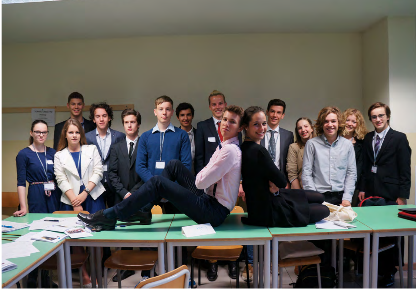
Bassano del Grappa, Italy, 9th-13th May 2016