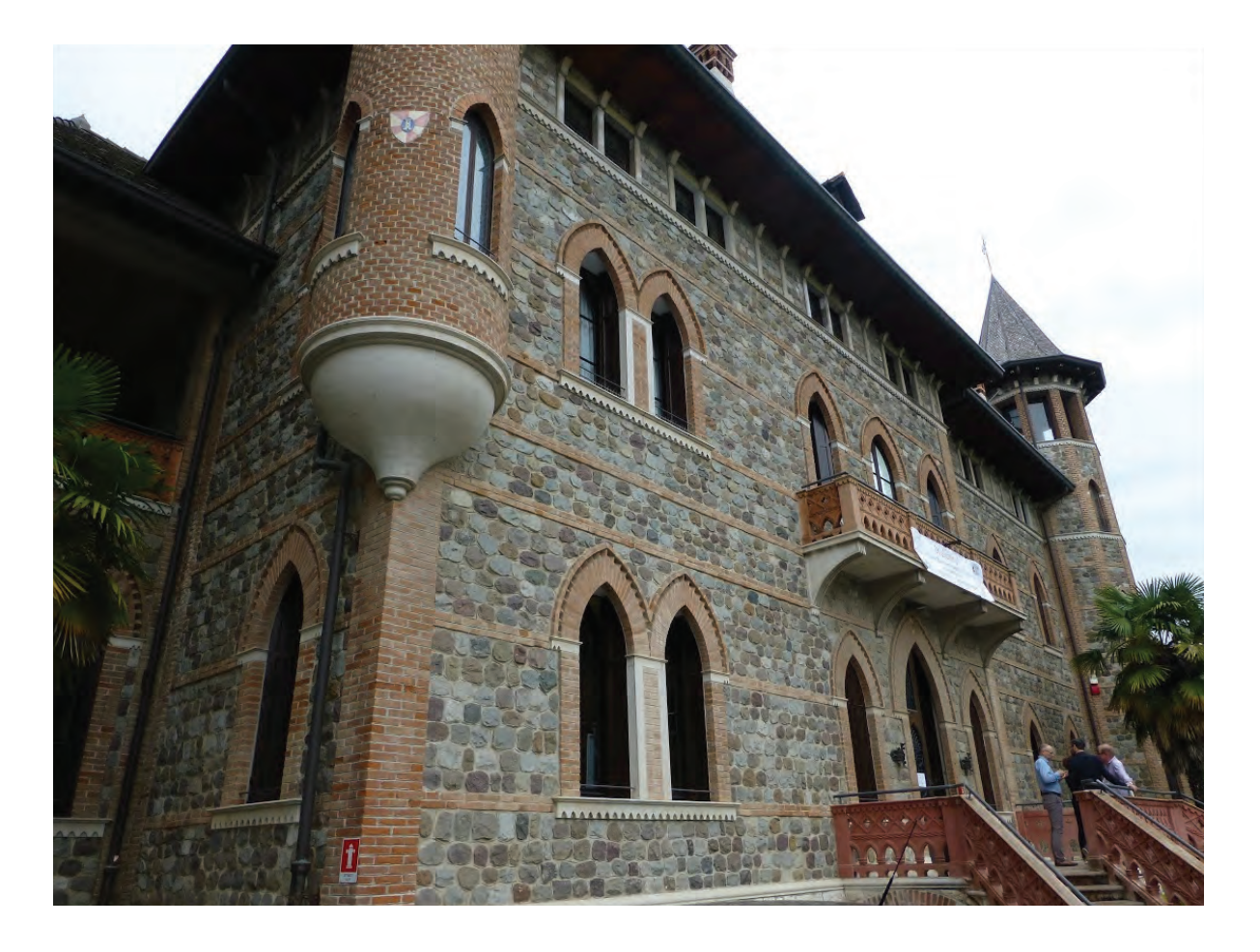
Bassano del Grappa, Italy, 9th-13th May 2016

town just 50km from your own can feel like travelling to a whole new country. In the world, we're mostly known for winter sports and for having the oldest grapevine in the world (sorry, South Tyroleans!). It's about 400 years old and situated in Maribor. Nature is extremely important in Slovenia, with 60% of our territory being covered by forests and 11.5% of our countryside protected by various environmental acts. Also, the Lippizaners are ours ;).