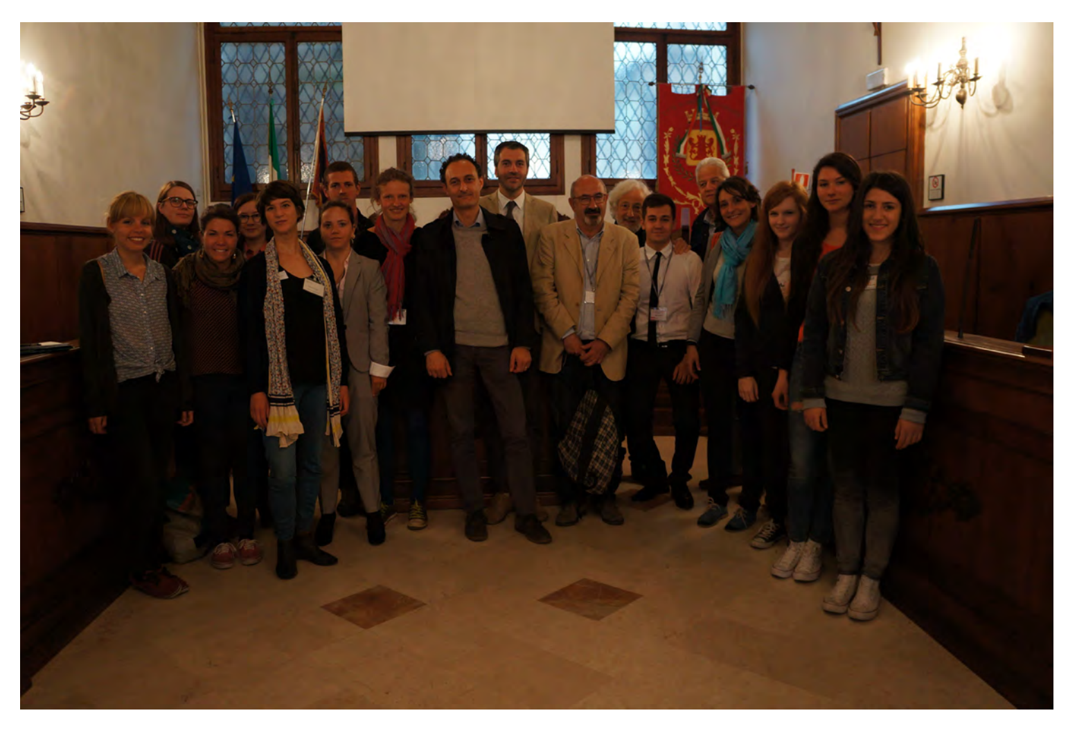
Bassano del Grappa, Italy, 9th-13th May 2016