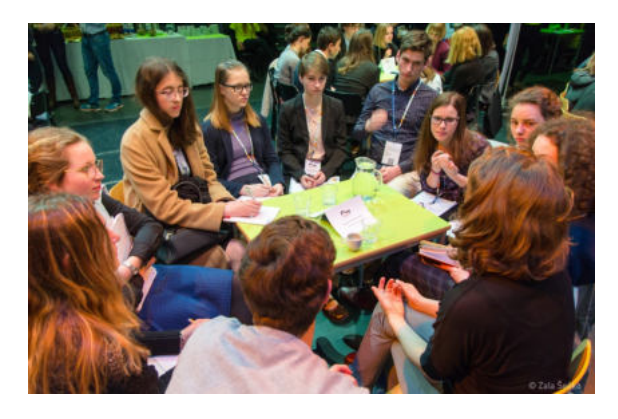
Discussion in the World Café