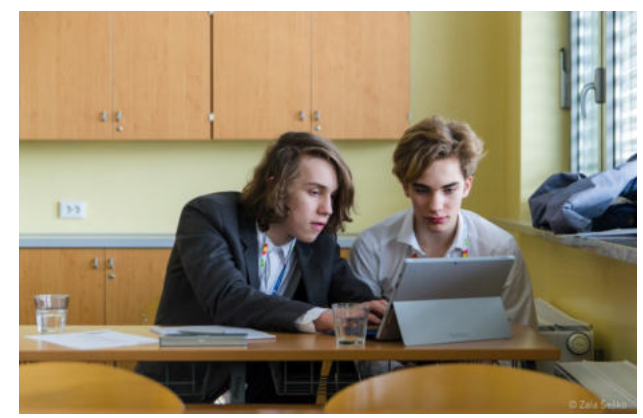
EUSALP people discussing stuff