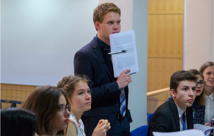
When they actually ask the question you have been fearing