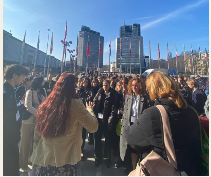
Arrival at Ljubljana