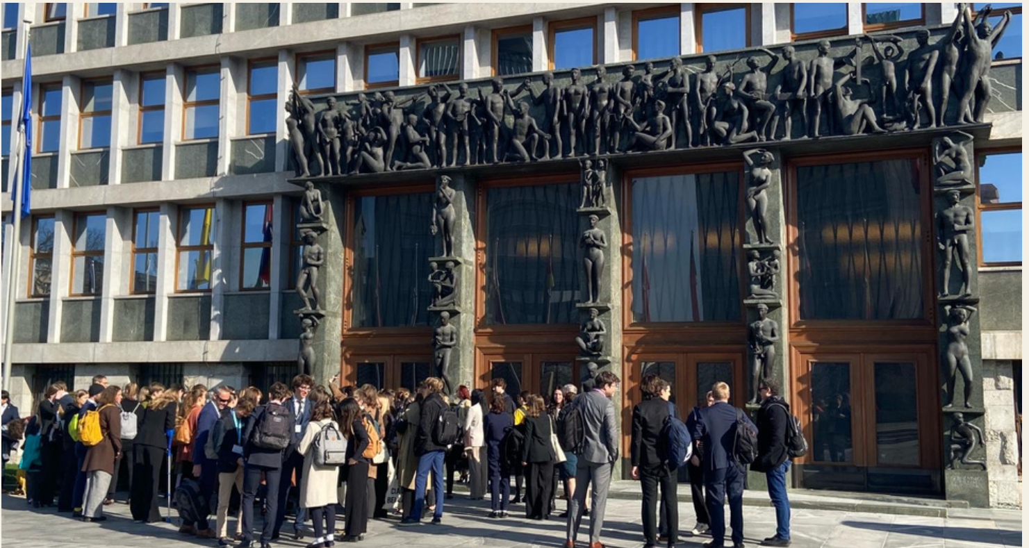
Parliament of the Republic of Slovenia

This postulation is about proposing a label which incorporates sustainable and traditional products in protected natural areas and connects all Alpine countries. The emphasis is on the local farmers in the protected areas. Additionally, promoting their traditional way of farming which includes ecological sustainability, improves their living conditions. Due to stricter regulations regarding agricultural work, the prices of those products may be higher than the ones of industrially produced products but by making agriculture and farming more sustainable, the price justifies itself. Therefore, social support for the farmers will be initiated. As an approach, the advertisement via social media promotes the production of commodities in the protected areas. By labelling the products of Alpine farmers, the sellers learn about the importance of sustainable farming.