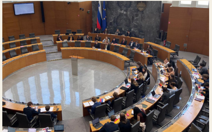
YPAC delegates in the parliament